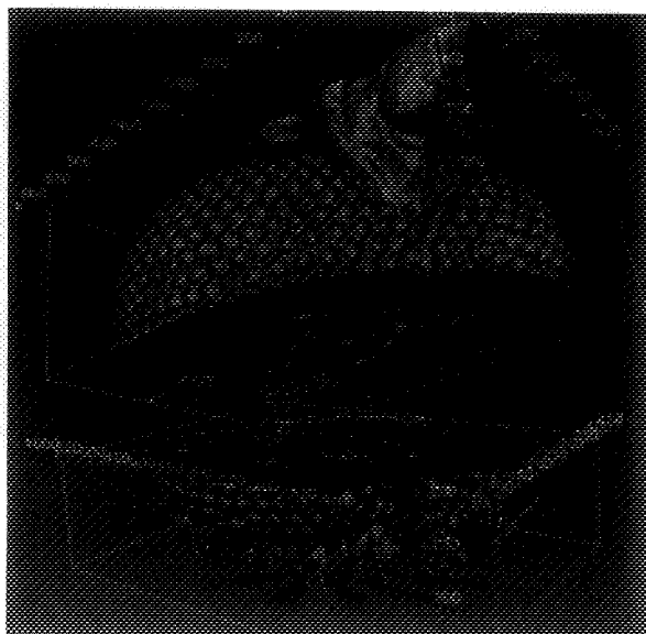
Figure 2: Volumetric reconstruction of mosquito head (control population). A virtual cross-section through the sample shows the internal void regions. The CT scan consisted of 1000 projections, the distances in the image are given in micrometers.