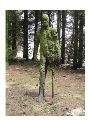
Figure 2<sup>3</sup> "Im Tal" (in the valley) – locations for art and events created by Erwin Wortelkamp