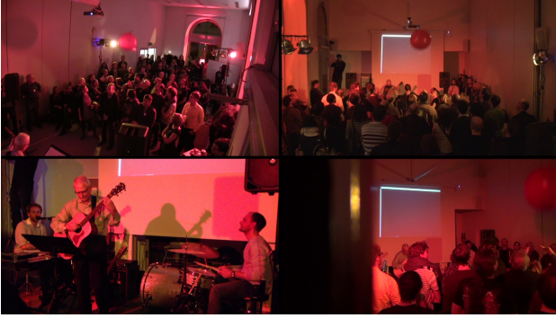
Figure 5. Four cameras synchronised in one screen for video-analysis.

plicable for a live concert without any loss of plausibility or credibility.