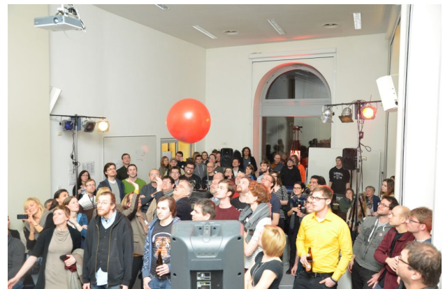
Figure 1. Balloon in the audience.

This approach originated from the idea to develop a versatile and engaging concept for interactive audience participation which includes all spectators. Unlike other interventions exploring audience participation, no additional