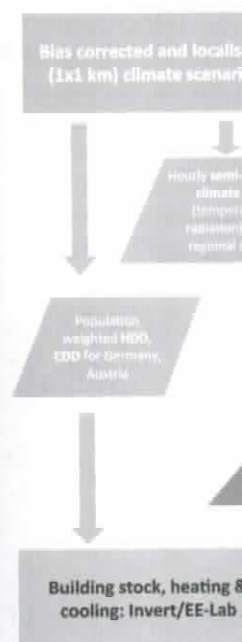
Fig. 14.1 Documentation of the model cluster for deriving the impact of climate change on electricity

All impact chains which we labeled as “quantified” in Table 14.1 are covered in this approach (Fig. 14.1): change in river run-off levels, wind and PV power generation are taken into account in HiREPS via the hourly climate data described in Sect. 14.4.1 and on a monthly basis the derived results for river run-off in Austrian water basins. Increased cooling energy demand in summer and decreased heating energy demand in winter are considered in HiREPS via the total change of annual final energy demand as well as the change in hourly load profiles and thus also the changes in peak loads.