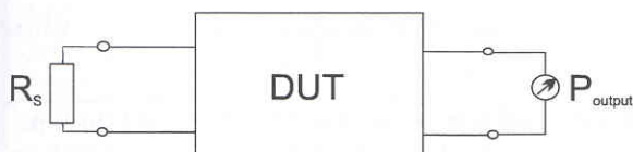
Fig. 1. Noise measurement with Y-factor method.

The idea of these papers is to explain a Sun noise experiment done with the receiving system at the Vienna's LEO satellite ground station. The measurements are based on the Hot/Cold Method , also known as the Y-factor Method . In the following we will discuss this method in general. The measurement set up is presented in Fig.1. Here, DUT means Device Under Test.