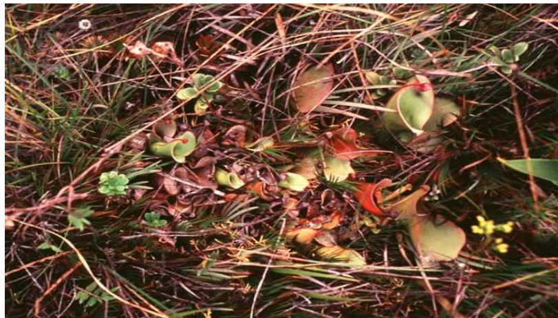
Figure 1 - Heliamphora nutans within a dense vegetation of non carnivorous plants.

Concerning air temperature and solar radiation, no significant differences between the conditions within the Heliamphora population and 2 m above was found. Air humidity, however, was more than two times higher next to the Heliamphora plants. The humidity decreased abruptly about 1.7 m above the ground. Interestingly, this was also the maximum height of Bonnetia trees at the test site. The wind speed could not be measured continuously, but was always very low and almost zero within the Heliamphora population.