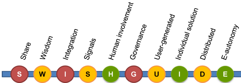
Fig. 1. SWISHGUIDE

Figure 1 demonstrates the SWISHGUIDE categories and the relevant factors of each category. In the rest of this section, the SWISHGUIDE factors will be introduced in more detail.