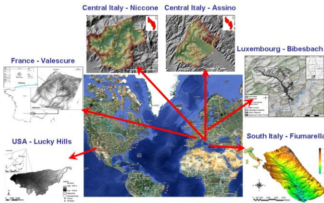
Fig. 1. Location of the six catchments selected in this study.

analyzed. For sake of brevity, the reader is referred to the cited references for more details about the characteristics of the catchments and of the available hydrometeorological data. The catchments are characterized by different size and, specifically, by large differences in the climatic conditions (from very arid at Lucky Hills to cold and wet at Bibeschbach). For each catchment, hourly rainfall, temperature and runoff data for the period 2007-2010 are employed.