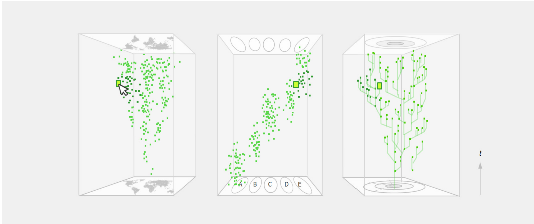
Figure 2: Coordinated multiple space-time cubes, with a geo-temporal (left), a categorial-temporal (center), and a genealogical (right) layout, displaying the same data collection, subselection, and single artifact.

But the STC also allows higher dimensional integration : More than three data dimensions could be perceptually integrated by either using other visual encodings (like color, size, shape, etc.) within a STC, or by the InfoVis technique of coordinated multiple views, which also can be implemented as coordinated, multiple space-time cubes (figure 2). The data planes of such parallel STCs can cover different data dimensions and layouts while sharing the same selection of time. Further interactive integration thus is available through the method of coordinated highlighting of selected data elements or linking and brushing [4]. Deduction : The implementation of coordinated multiple STCs extends the method's potential to provide synoptic overviews [DR 1] and allow users to synchronously explore multiple dimensions in parallel [DR 3].