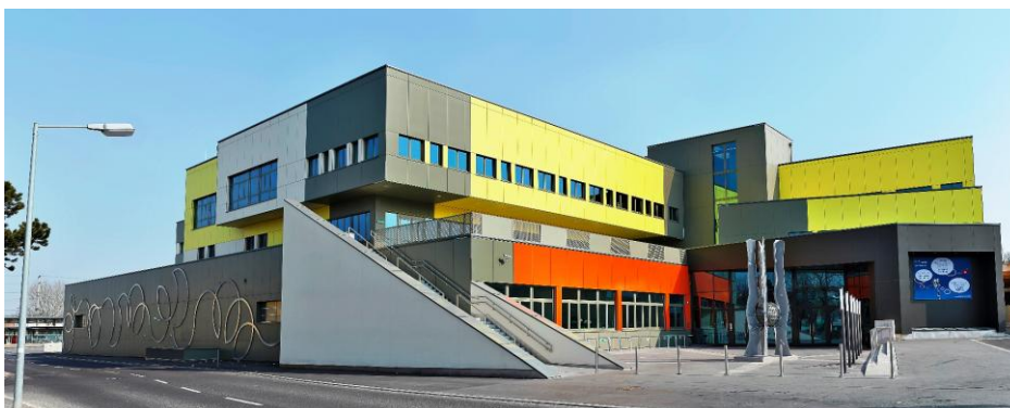
Fig 2: The multipurpose hall “Multiversum” in Schwechat

The three described scenarios will be piloted in the context of nine sites across five countries which includes e.g. for Italy 20 public buildings in Ferrara; 60 technical buildings across the Trentino Province; 4 public illumination lines in the centre of Bassano del Grappa (Italy), 5 public illumination lines in the city of Rovereto (Italy) 3 building complexes in the area of Val di Non (Italy) and their outdoor public illumination systems.