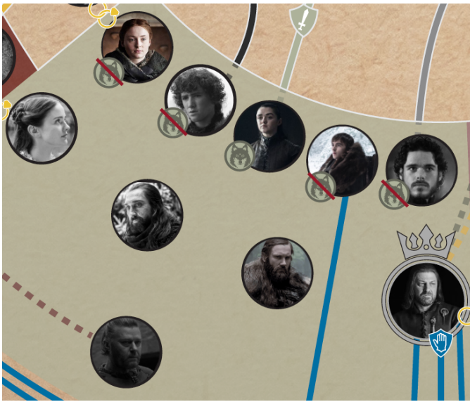
Figure 2: The “Stark” family tree. Their pets are shown too (dead pets are the ones whose icons are crossed by a red bar). It is easy to understand who are the surviving members of the family.