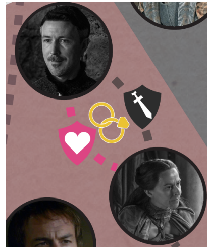
Figure 1: An example of two characters that are married (notice the two rings) and lovers (the pink edge). However, “Littlefinger” (the character at the top) killed “Lisa Arryn” (notice the dark edge with the sword pointing towards her). By looking at the colors of the portraits, it is possible to see that both characters died.