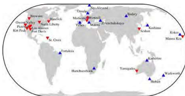
Fig. 1: CONT17 legacy network A (mostly VLBA) in red and network B in blue.

(Correspondence: johannes.boehm@geo.tuwien.ac.at)