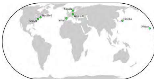
Fig. 2: VGOS station network during CONT17. ONSA13NE has been verifying the VGOS chain at the time of CONT17 and is not used here.

The legacy A network with 14 stations (mostly VLBA, correlated in Socorro) observed at a data rate of 256 Mbit/s and the legacy B network, also with 14 stations (correlated in Bonn), used a data rate of 512 Mbit/s (see Fig. 1). On the other hand, the VGOS network with six stations (see Fig. 2) observed at 8 Gbit/s and the baseband data were correlated at MIT Haystack Observatory.